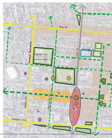
North Park Big Ideas

Council has resolved to pursue a reduction in the City’s default speed limit. After reviewing a staff report on January 7, Council directed staff to finalize any